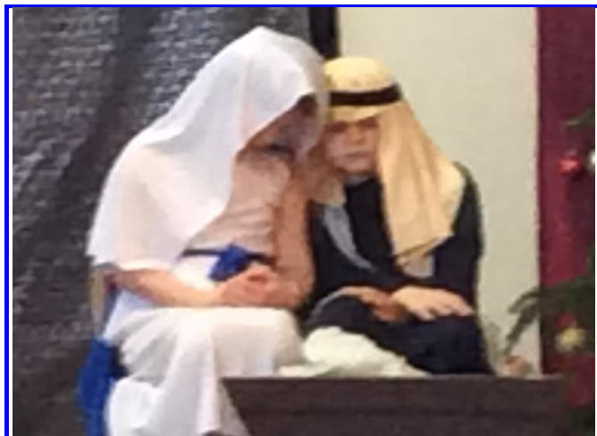
Our Prayer Leaders

There are two children from each class who have been chosen to help lead prayer in our school. They also support the Catholic Life of the school and during December have promoted the CAFOD World Gifts Appeal. Thank you to our families for your generous donations of £71. As a school we have been able to purchase 'The net that protects,' a 'Happy Queen Bee,' a 'Vegetable Garden,' some 'Wonderful Worms,' 'Fabulous Football' and the gift to 'Teach someone to Read' as well as some 'Chirpy Chicks'. These gifts will have a real and lasting difference to families living in developing countries.